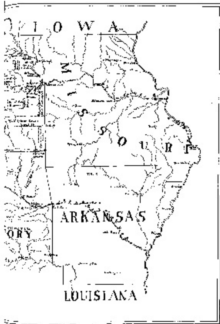
THE LOCATION OF TRIBES WITHIN THE INDIAN COUNTRY